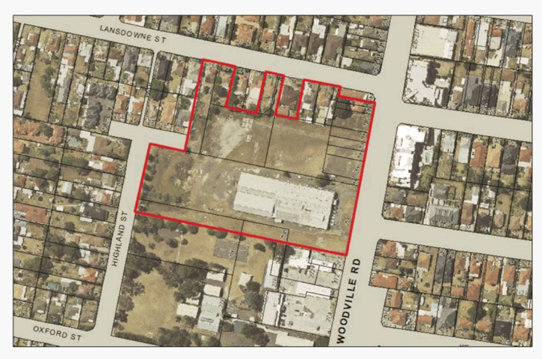
Aerial view of Merrylands Property